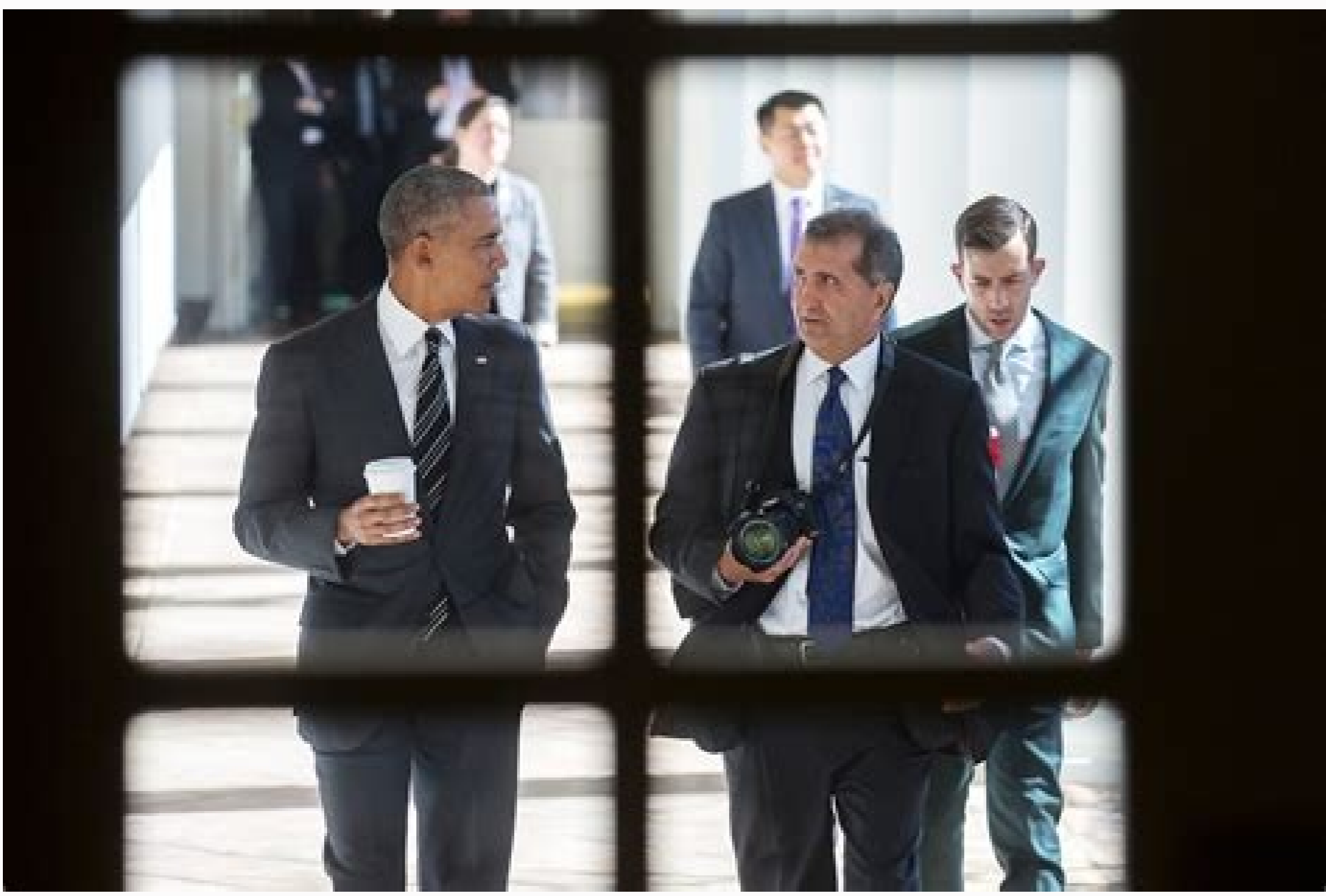
The way i see it documentary watch online. Pete souza the way i see it documentary online.